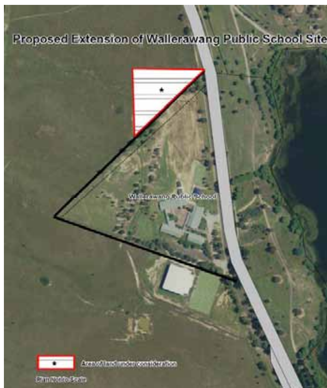
Map showing area for negotiated lease/agreement.

The land is located partially within an easement for a high voltage transmission line. Therefore the future use of the land is limited.