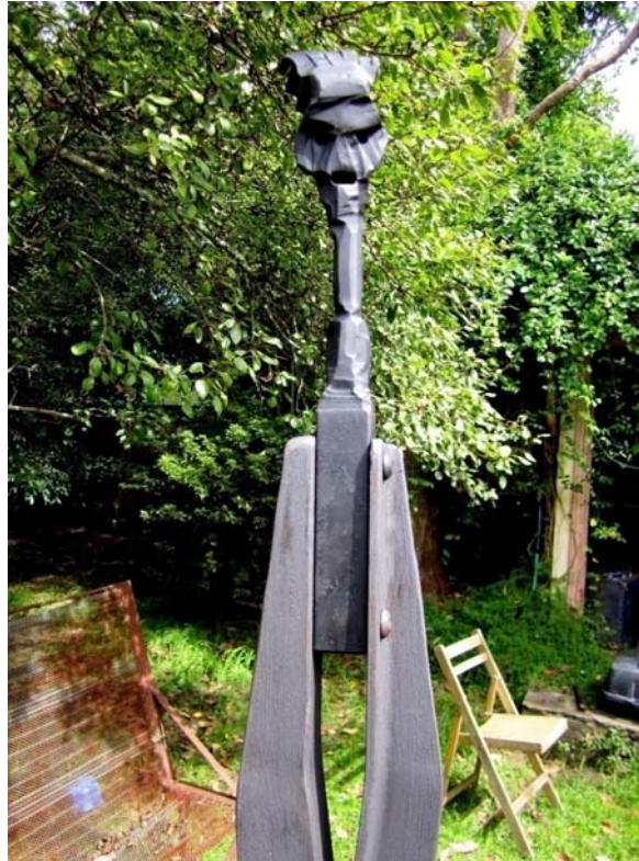
Figure 4 Marker/Guide Post Example