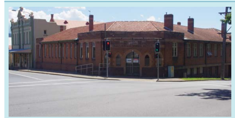
When it was opened in 1927, the Charles Hoskins Memorial Institute "was described as one of the best of its kind in Australia" (NSW State Heritage Inventory Form - Sydney Morning Herald 1927).

Construction has commenced on the refurbishment of local landmark, the Charles Hoskins Institute (Old Library) by the University of Western Sydney.