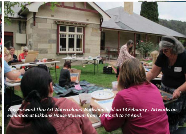
Way Forward Thru Art Watercolours Workshop held on 13 February. Artworks on exhibition at Eskbank House Museum from 27 March to 14 April.