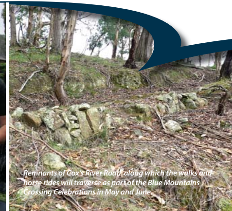
Remnants of Cox's River Road, along which the walks and horse rides will traverse as part of the Blue Mountains Crossing Celebrations in May and June.