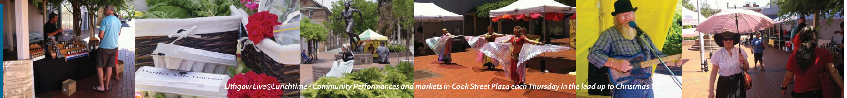
Lithgow Live@Lunchtime - Community Performances and markets in Cook Street Plaza each Thursday in the lead up to Christmas