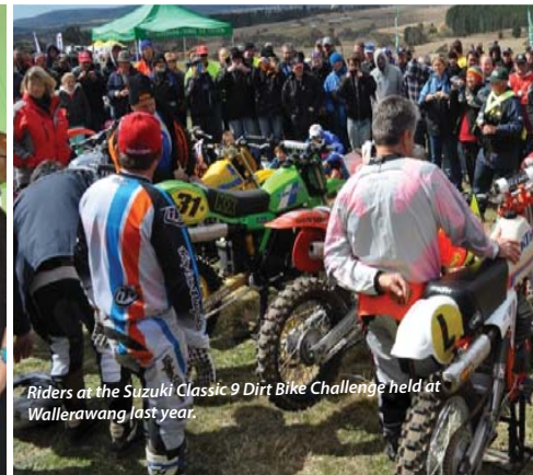
Riders at the Suzuki Classic 9 Dirt Bike Challenge held at Wallerawang last year.