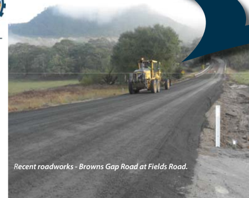
Recent roadworks - Browns Gap Road at Fields Road.

In conjunction with the road works Council will also be finalising the widening extension upgrade on the bridge. The work provide for dual vehicle passage across the existing creek. Further road approach re-alignment works to both sides of the bridge will be undertaken upon the relocation of an existing power pole and overhead power cables.