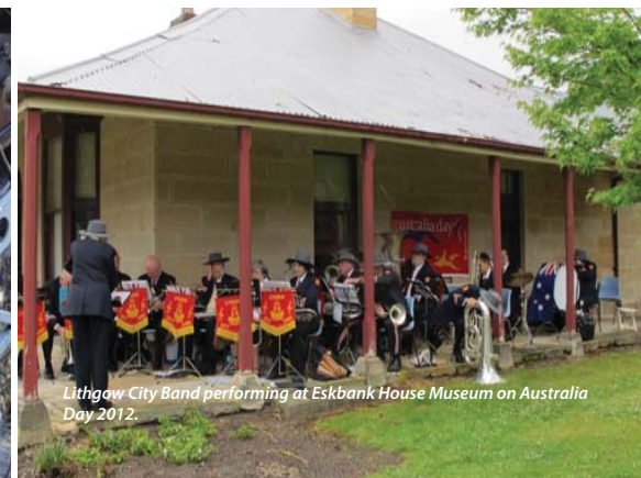
Lithgow City Band performing at Eskbank House Museum on Australia Day 2012.