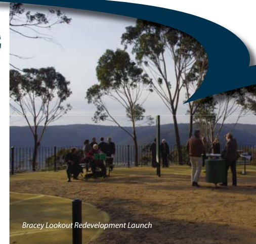
Bracey Lookout Redevelopment Launch