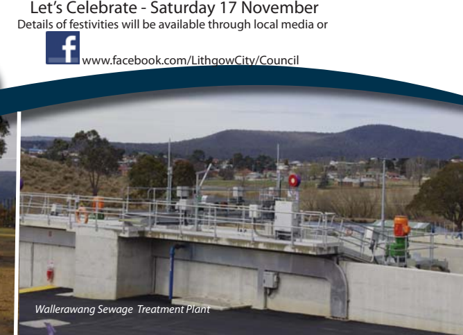
Wallerawang Sewage Treatment Plant