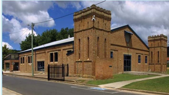
The task of demolition and relocation of this building in 1936 was a great volunteer effort. The original building was 100ft by 84ft, contained 31 windows and more than 80,000 bricks.

On 3 June 1936, the Sydney Morning Herald reported the proposed relocation of the 'old power house' from the steelworks site to the showground site. This is a wonderful story of adaptive re-use - an industrial building to a dance hall which is still serving the community in this capacity today.