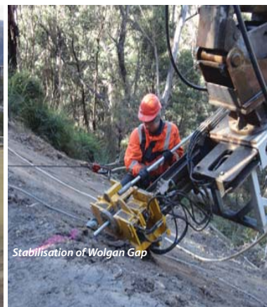
Stabilisation of Wolgan Gap