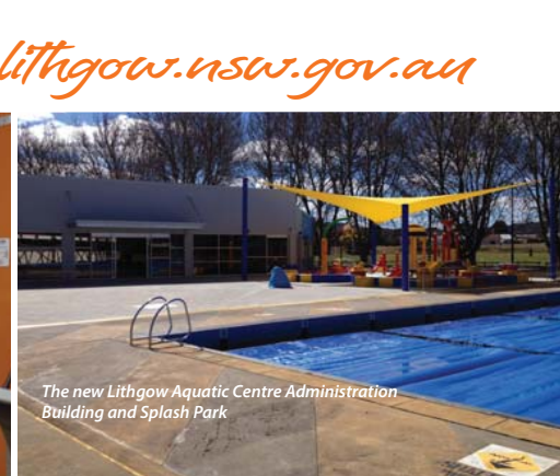
The new Lithgow Aquatic Centre Administration Building and Splash Park