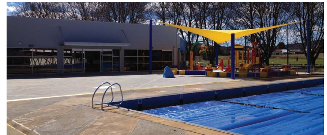
New Administration Building, amenities, Cafe/Kiosk and Children's Hydro Play area.

Stage 1 Lithgow Aquatic Centre - $2.1 million Wallerawang Sewage Treatment Plant - $8.2 million Bracey Lookout Redevelopment - $100,000