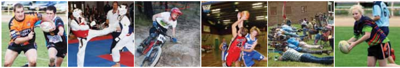
Both individual and group sporting and adventure activities abound in the Lithgow area